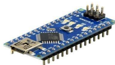
Fig (4) Ardiuno Nano

Arduino Nano is a microcontroller board designed by Arduino.cc. The microcontroller used in the Arduino Nano is Atmega328, the same one as used in Arduino UNO. It has a wide range of applications and is a major microcontroller board because of its small size and flexibility. It has 22 input/output pins in total, 14 of these pins are digital pins, 8 analogue pins, 6 PWM pins among the digital pins. It also has a mini USB Pin which is used to upload code and Reset button. It is used in Embedded systems, automation, robotics, etc.