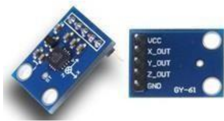
Fig (1) Accelerometer

Accelerometers have multiple applications in industry and science. Highly sensitive accelerometers are components of inertial navigation systems for aircraft and missiles. Accelerometers are used to detect and monitor vibration in rotating machinery. Basic structure of accelerometer consists fixed plates and moving plates (mass). Acceleration deflects the moving mass and unbalances the differential capacitor which results in a sensor output voltage amplitude which is proportional to the acceleration. By sensing the amount of acceleration, users analyze how the device is moving.