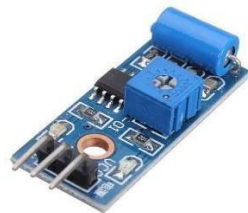
Fig (2) Vibration Sensor

Vibration sensor is different from resistive. Or vibration which is produced when earth- quake occurs when the piezo film is bent from the mechanical neutral axis, a very high strain within the piezo polymer is created and genera voltage. This voltage is created only as the sensor is deformed. The sensor produces positive voltages when they're deformed in one direction, and negative voltages when deformed in the other. As in other project we have used piezo sensor for sensing the impact of high tsunami waves. A piezoelectric sensor is a device that uses the piezoelectric effect to measure pressure, acceleration, strain or force by converting them to an electrical signal.